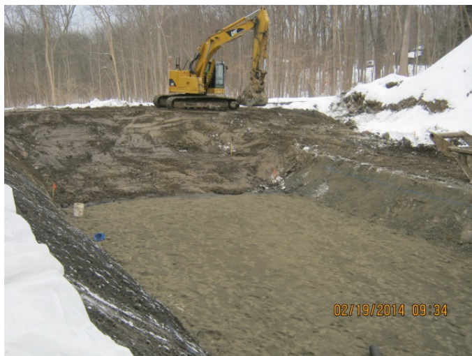
Cell 1 Construction: SE-POT-1

In a letter dated January 29, 2015 the NYSDEC has confirmed and approved the completion of projects totaling 251.4 kg/yr of phosphorus removal. EOHWC has submitted documentation for the final approval of projects totaling an additional 70 kg/yr on May 8, 2015 and expects the approval of these projects in the near future. Table