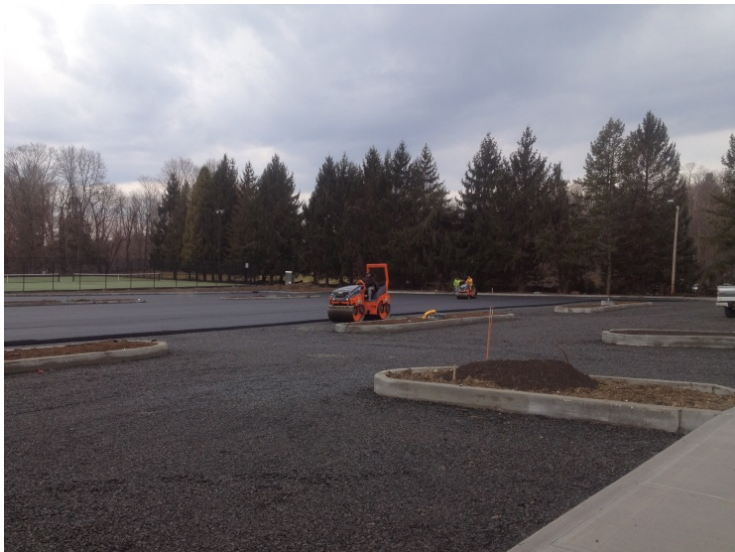
Porous Asphalt Installation: S-MU-09A

(CKWIC), the Putnam County MS4 Coordinating Committee (PCMS4CC) Stormwater Technical Advisory Committee (STAC), and the Dutchess County MS4 Coordination Committee.