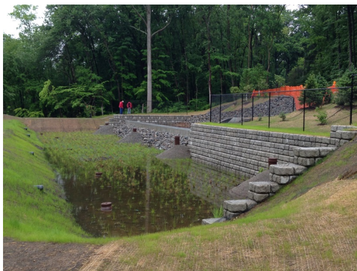
Subsurface Gravel Wetland: SE-POT-01

The following nomenclature is used in this Annual Report to describe project status: