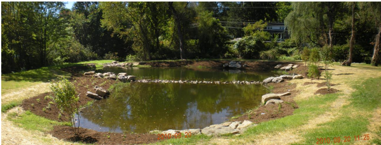
Retrofit at Laguna Road, Lake Carmel, Carmel, New York