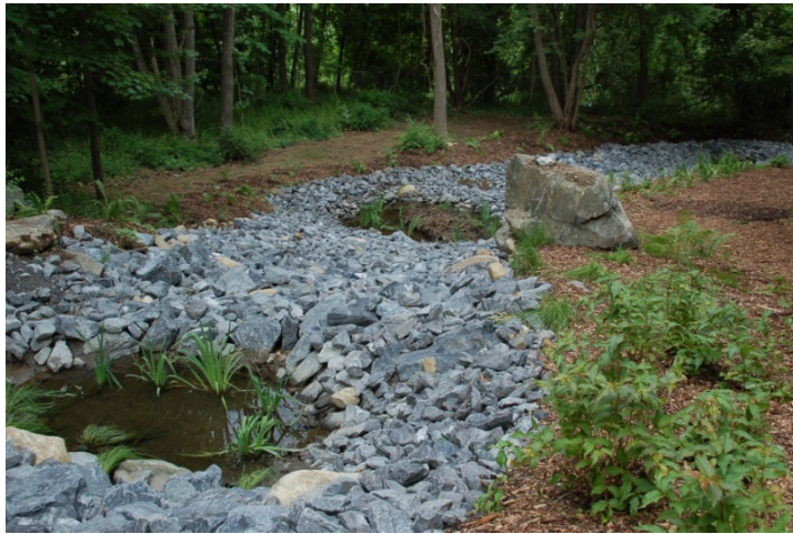
Plunge Pools- NS-MU-08/09

The Year 5 SRPs for each member municipality were identified by stormwater technical committees in Dutchess, Putnam, and Westchester counties and by Town personnel (e.g. town engineer, highway superintendent). The stormwater technical committees