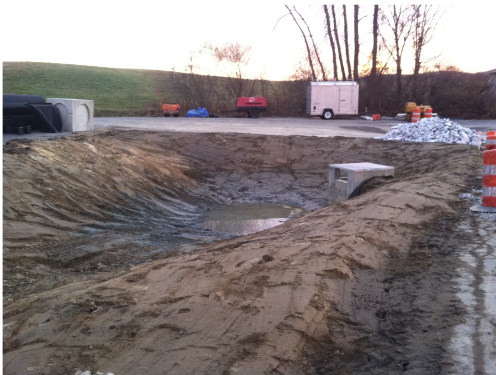
Bioretention Cell In Construction: Patterson-PA-11

Table 6 lists the stormwater retrofit projects accepted by NYSDEC in 2014 (Year 5). Year 5 of the retrofit program will encompass 2015 as well.